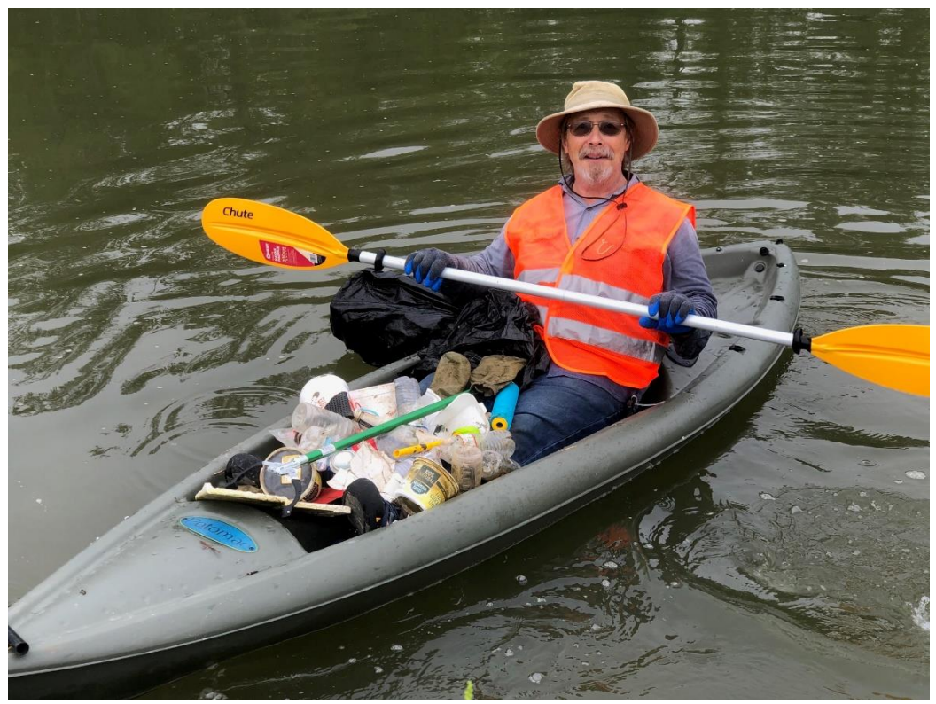
Texas Master Naturalist volunteer removed trash from the Guadalupe River in Kerrville.

Volunteer from Guadalupe Ranch Estates removed a large foam block from the North Fork.