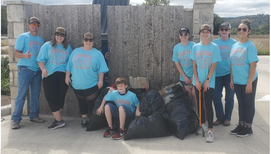
Volunteers from Community First National Bank cleaned up along the Guadalupe River in Kerrville.