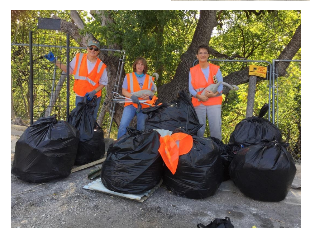
Volunteers from Riverside Nature Center with trash collected in Town Creek.