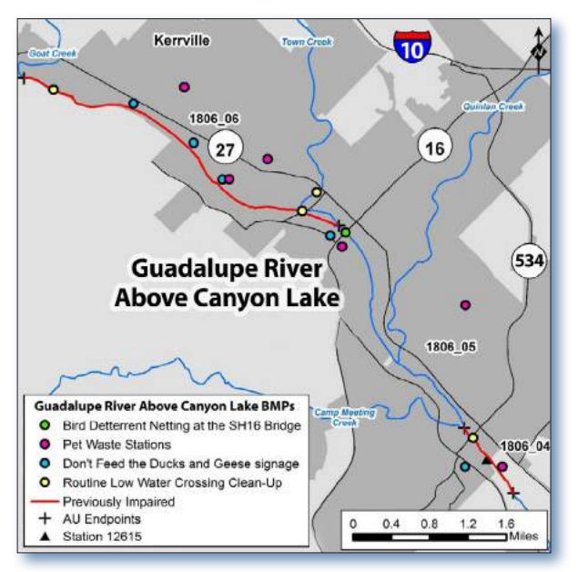
Figure 1. BMPs were implemented along Segment 1806 (includes impaired AUs 1806_04 and 1806_06).

In 2004 the TCEQ initiated a total maximum daily load (TMDL) project to conduct public outreach, identify sources and establish loads. The TCEQ adopted the TMDL in 2007 and approved the TMDL implementation plan (I-Plan) in 2011. The TCEQ provided the Upper Guadalupe River Authority (UGRA) with CWA section 319(h) funding to implement the I-Plan in partnership with the city of Kerrville, Kerr County, and the Texas Department of Transportation (TXDOT). To address the bacteria impairment, the I-Plan included implementing